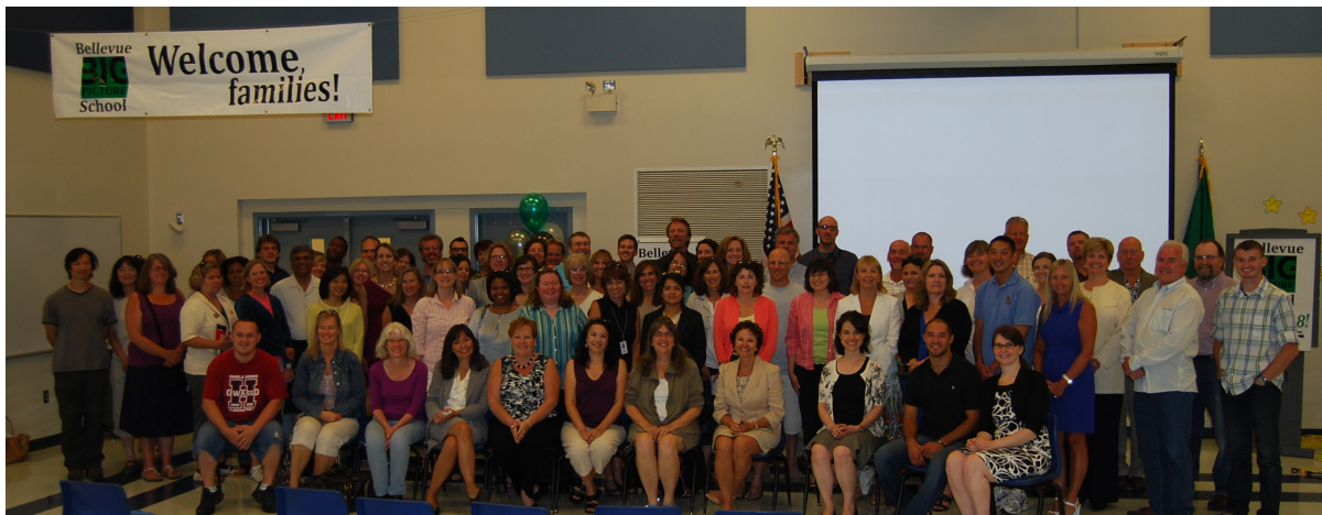
School and District Staff, Community and College Partners, and Parents celebrating the opening of Bellevue Big Picture School, September 6, 2011