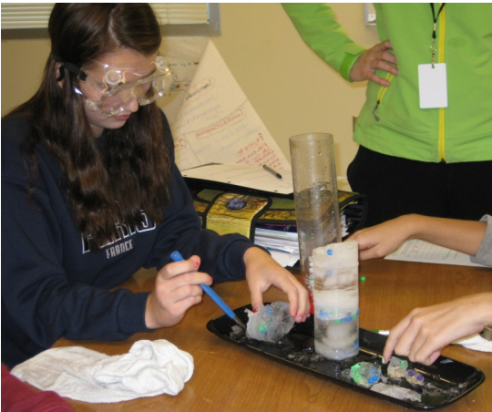
9th grade student working on climate change project through joint partnership with UW

The school is built around a thoughtfully designed problem-based and project-based curriculum that is aligned to state standards and college preparation with an emphasis on authentic work. The rigorous curriculum moves students from being collectors of knowledge to creators of solutions to real-world problems. Throughout their school career, students will learn how to take more responsibility for their own learning with their teachers as guides and mentors.